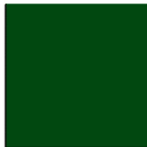
Racing Green (14C39)

The information detailed in this leaflet is liable to modification from time to time in the light of experience and of normal product application, and before using, customers are advised to check with Ronacrete Ltd, quoting the reference number, that they possess the latest issue. Any person or company using the product without first making further enquiries as to the suitability of the product for the intended use does so at his own risk, and Ronacrete Ltd can accept no responsibility for the performance of the product, or for any loss or damage arising out of such use.