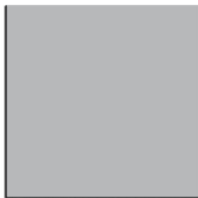
Mid Grey (00A05)